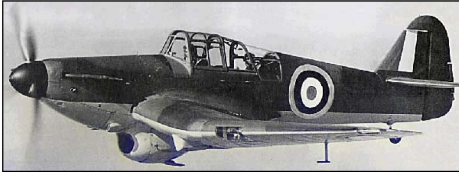
Miles M9A Master Mk1

The plaque describes his aircraft as a Mk 2 Master when in fact N8043 was a Mk 1