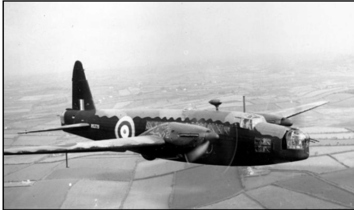
Vickers Wellington Mk.2

The following words are inscribed at the bottom of the plaque: