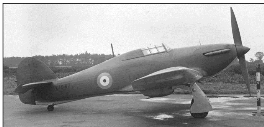
Hawker Hurricane Mk1

The plaque describes his aircraft as a Mk 2 Hurricane when in fact L1741 was a Mk 1