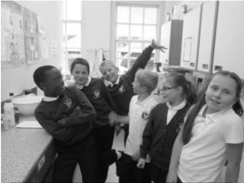
The Cookery Club who benefited from your vouchers

'TEN MILE BANK SCHOOL GIVE A HUGE THANK YOU to everyone who gave us their supermarket vouchers, as a small school we don't receive that many but as they say every little helps and we managed to buy with our vouchers :- Sainsburys – New cooking equipment i.e. whisks, peelers, tupperware boxes, timers, etc.'